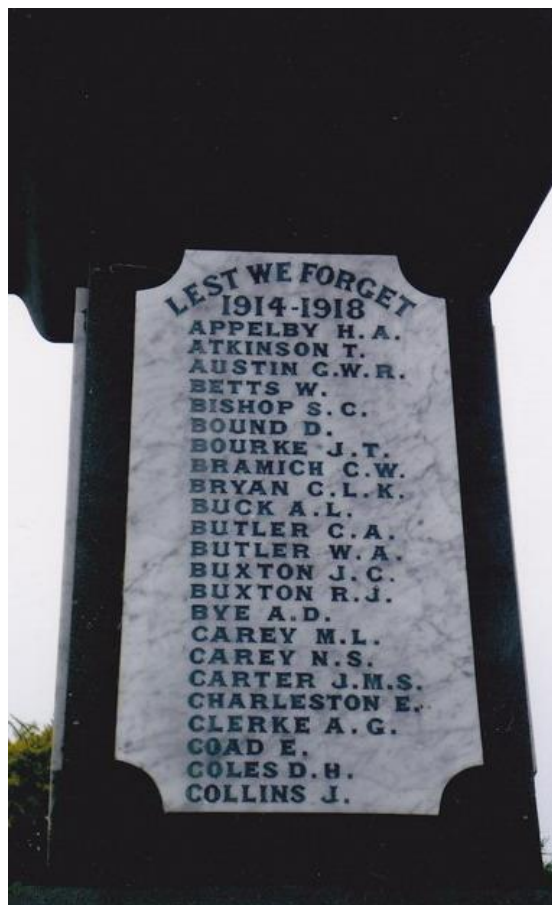
Sheffield War Memorial